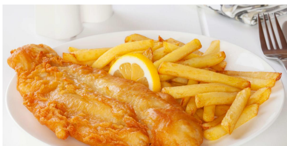
Trinity Friars Dinner Group