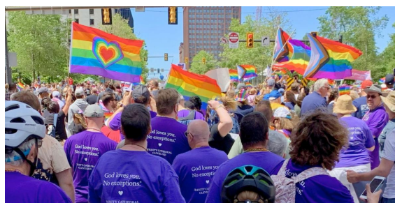
Volunteer: Pride in the CLE