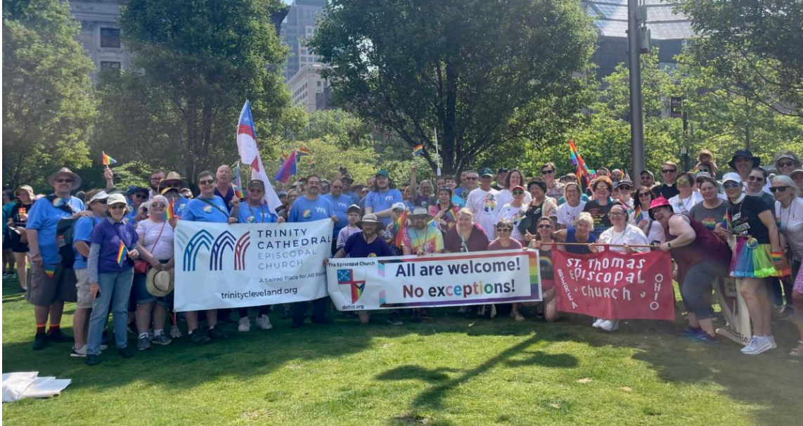
A group of over 120 Episcopalians participated in the last week's Pride in the CLE march.